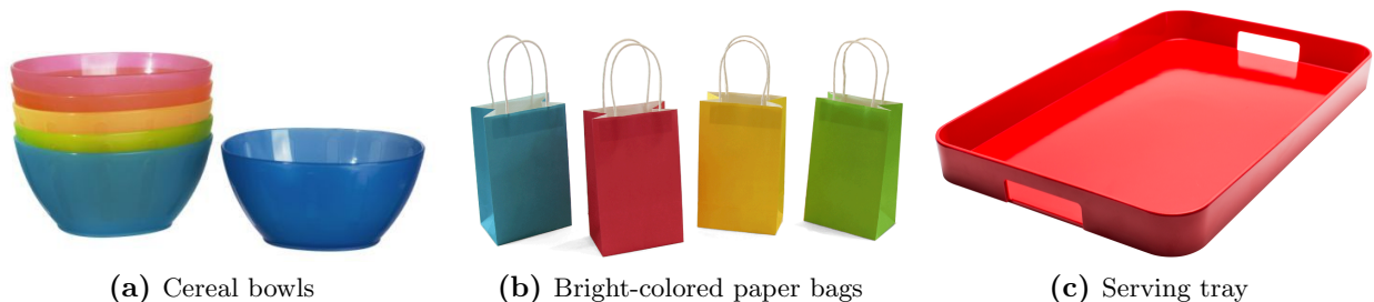
Figure 3.2: Example of object containers

During the competition, objects can be requested based on their Object Category , physical attributes, or a combination of both. Relevant attributes to be used are: